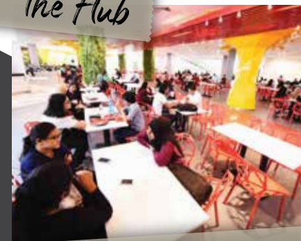
Books & Gifts